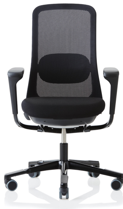
Design: Frost Produkt AS, Powerdesign AS and Flokk Design Team Patent- and design protected